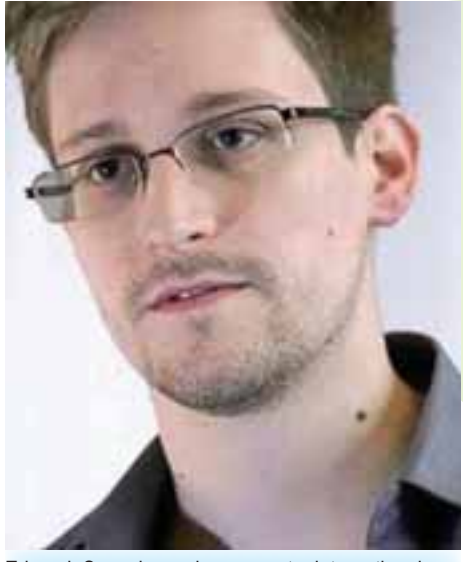
Edward Snowden, who came to international attention after disclosing to several media outlets thousands of classified documents