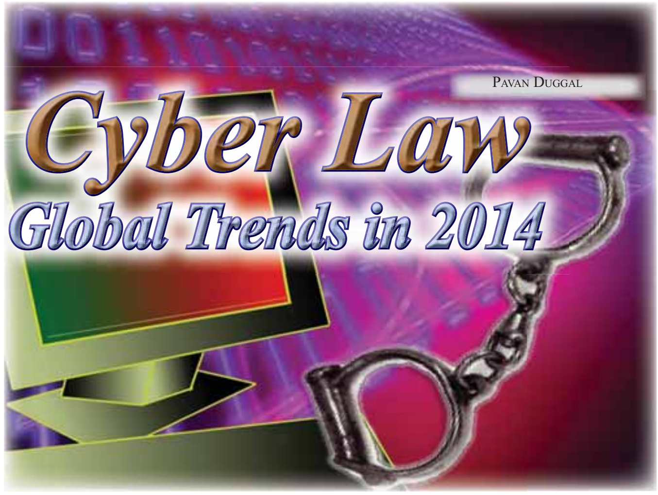
In the year 2014, Cyberlaws may have to tackle several issues ranging from increased thrust in cost-effective interception surveillance to providing far more protection and preservation of individual stakeholder's online privacy in the digital and the mobile ecosystem and also protection from increasing cyber attacks.

THE advent of the Internet, the mobile and the digital ecosystems have ushered all of us in a new irreversible era in our lives. A digital platform has been added which runs our lives, more or less, in terms of keeping in touch with friends and relatives, communicating with business peers and clients, seeking and providing services, digging out information, and even providing e-governance.