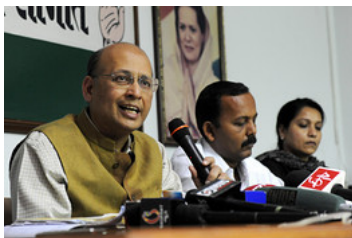
A video purportedly showing Congress leader Abhishek Manu Singhvi, far left, having sex with a woman could have repercussions that go beyond immediate concerns over its legality.

A leaked video purportedly showing senior Congress politician Abhishek Manu Singhvi having sex with a woman in his office raises questions about how to balance the right to privacy with public interest.