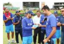
NEEDED! Brave youngsters in the team