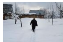
Freezing cold leaves Kashmir shivering