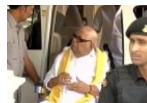
Karunanidhi makes court appearance in defamation case; hearing adjourned