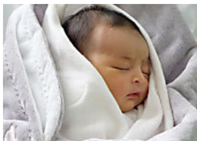
LOOK: Adorable 2015 celebrity babies ABS-CBN Philippines