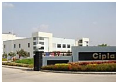
Cipla forms alliance with Serum Institute to market paediatric vaccines in Europe