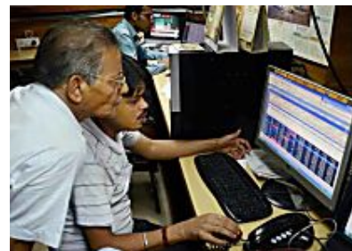
41 stocks beat market returns for 5 yrs