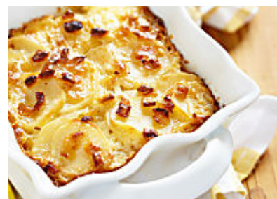
Oven-baked creamy wild garlic and cheese potatoes recipe IrishCentral