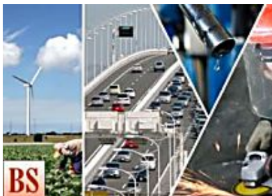
Sonia Struck Off Bjp Hitlist