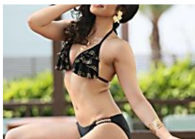
Sneak peek at Miss India Kolkata 2016 bikini shoot Times Of India