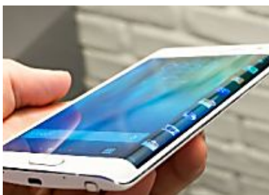
Experts shocked, as new trick saves online shoppers thousands in India MegaBargain 24