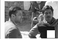
Spotted: Salman, Nawazuddin shoot for Bajrangi Bhaijaan in Mandawa

Yay or Nay - Hawaizaada Ayushmaan Khurrana's latest look