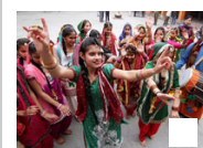
Lohri, Makar Sankranti celebrations across India