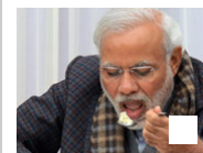
Paswan's special Makar Sankranti treat for PM Modi