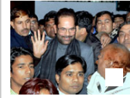
Mukhtar Abbas Naqvi held for poll code violation