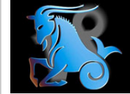
Here is your horoscope for the day: January 15, 2015