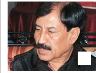
Trinamool MP Prasun Banerjee slaps Kolkata traffic constable